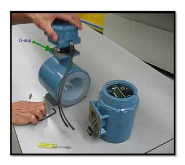
NOTE Make sure the terminal block openings are all the way open.

Remove the junction box exposing the terminal block of the sensor. Note that there is an o-ring in a retaining groove on the pedestal of the sensor. Make sure that the o-ring stays in place.