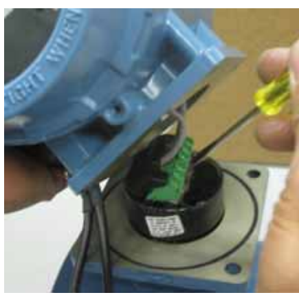
Step 5: Position the transmitter

With the wire harness attached, position the transmitter over the sensor and set upon the sensor. Make sure that the o-ring is properly seated in the retaining grove to prevent it from being pinched.