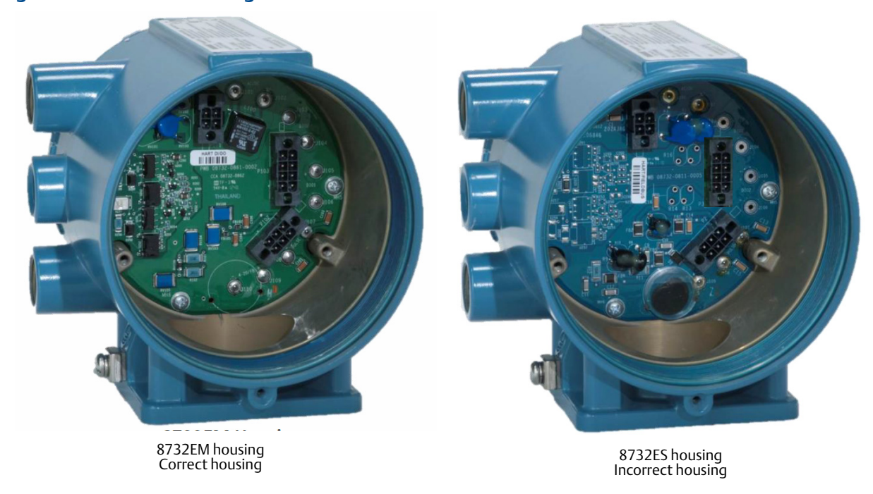
Figure 2. Transmitter Housing Electronics Board Identification

3. Confirm the electronics is for an 8732EM transmitter. Refer to the picture on the left in Figure 3.