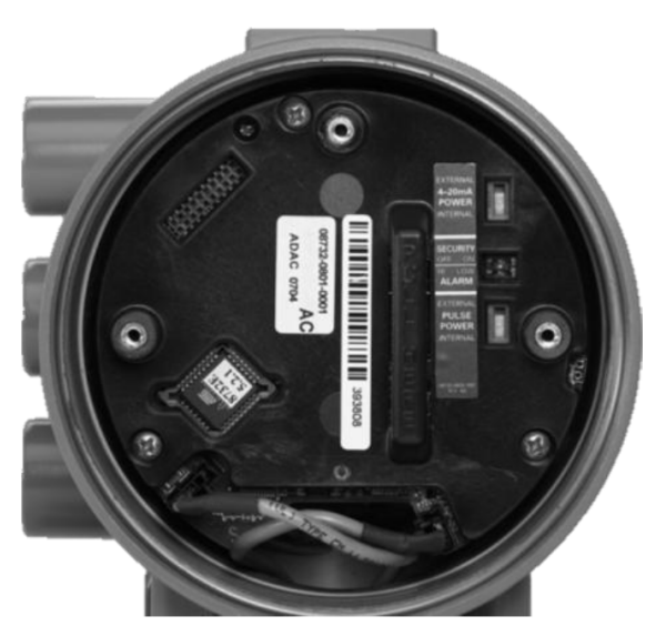
8732ES electronics stack