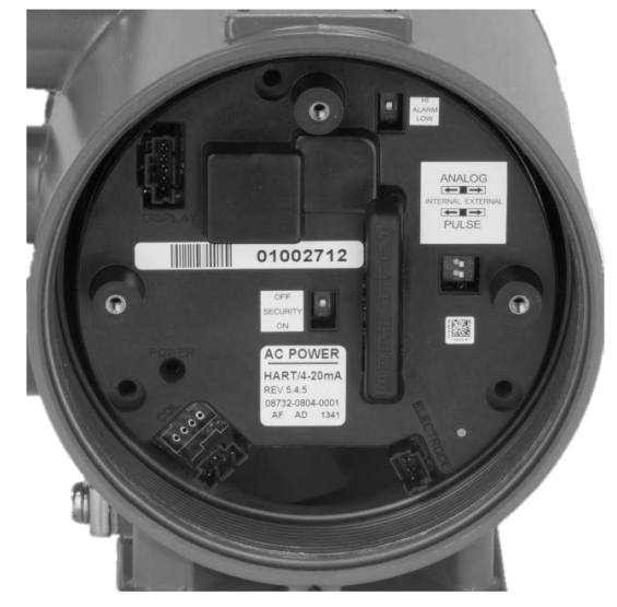
Figure 3. Electronics Stack Identification

3. Confirm the electronics is for an 8732EM transmitter. Refer to the picture on the left in Figure 3.