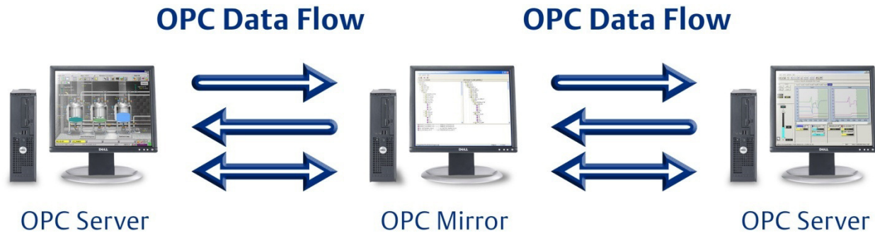
Data transfer between OPC servers is easy with OPC Mirror