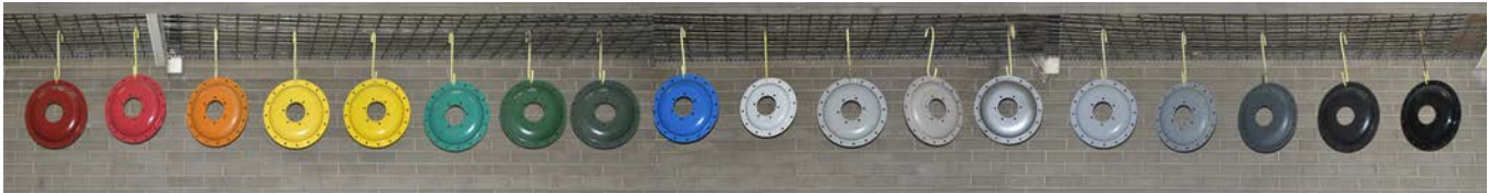
Figure 2. Any Color of Powder Coating Can Be Specified; A Sampling of Available Colors are Shown on Actuator Casings