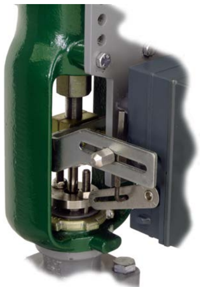
Figure 7. Heavy Zinc Plating Specifications