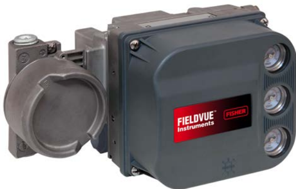
Figure 5. Fisher DVC6200 Digital Valve Controller Stainless Steel Version

As an alternative to painted instruments, the FIELDVUE™ DVC6200 digital valve controller can be furnished with a stainless steel module base, housing and an all-stainless mounting kit. The sealed terminal box isolates field wiring connections from other areas of the instrument and keeps water and harsh atmosphere away from electronic components. The DVC6200 stainless steel version eliminates all diecast aluminum parts, which greatly increases its resistance to the tough, corrosive environments found on offshore platforms, within chemical plants, and inside refinery processing units.