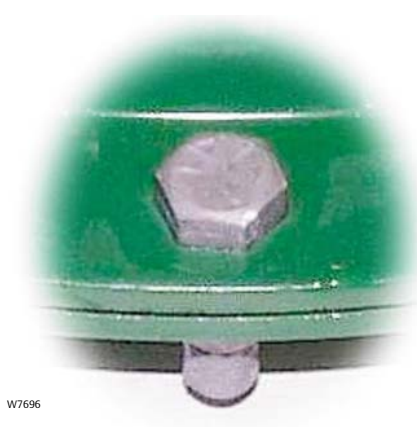
Powder-Coated Actuator Casings with NCF Coated Cap Screws after 500 Hours in an Accelerated Salt Spray Laboratory Test