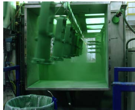
Figure 1. Powder Coating is Nearly 100% Free of VOCs