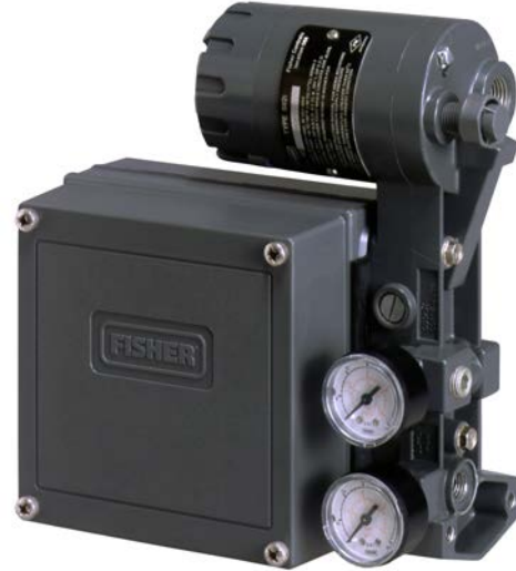
Figure 4. Fisher Instrument with Standard Finish

Comparisons of paints other than standard have shown no advantages in using other paints. Because of the potential impact on instrument performance, we are unable to apply coatings or paints other than our standard.