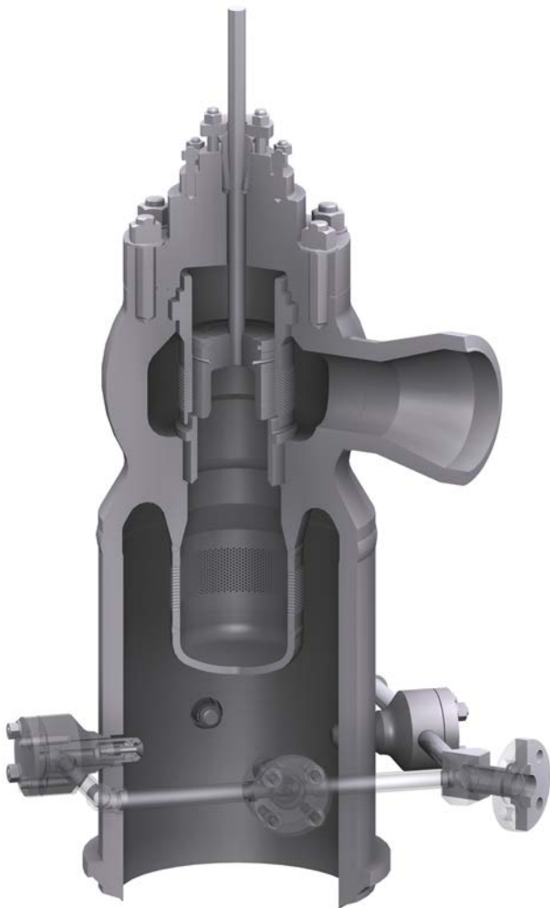
CVX WITH WELDED DIFFUSER