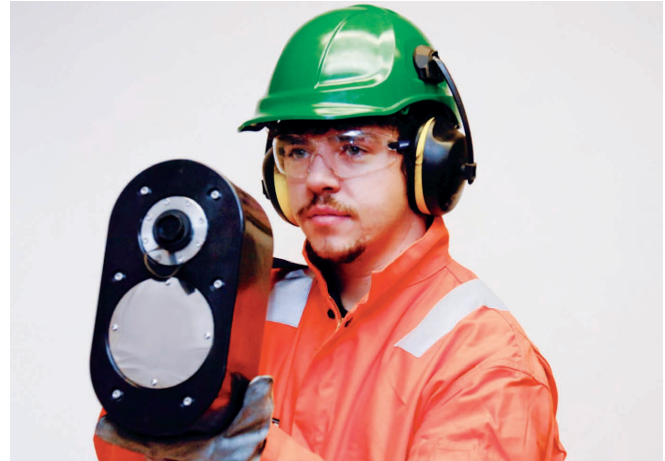
Emerson technician with MT Mapping Tool.