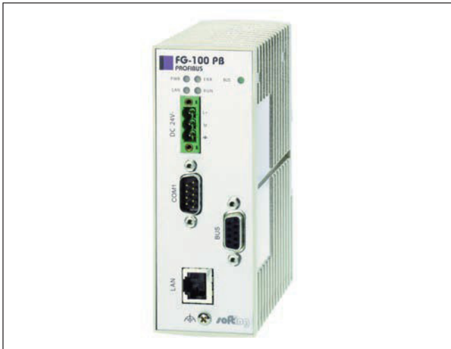
Use the Softing linking devices listed below to connect AMS Device Manager to PROFIBUS segments on third party hosts.