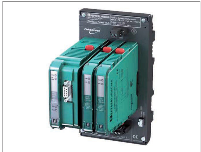
Use Pepperl + Fuchs PROFIBUS segment coupler to connect AMS Device Manager to PROFIBUS PA devices on DeltaV systems or third party hosts.