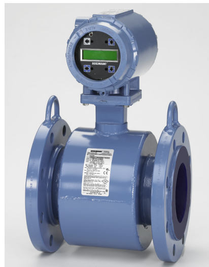
The Rosemount 8732 flowmeter

By using meter verification diagnostics, the customer eliminated flow lab costs, maintenance costs, and shipping costs.