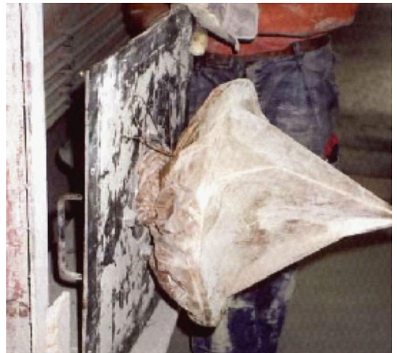
The parabolic antenna and a Teflon (PTFE) cover to protect against dust.

Without a reliable level measurement, there is always a possibility of over- or under-filling the silo, which affects productivity.