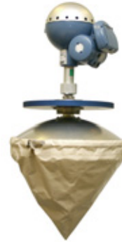
Rosemount 5600 with a parabolic antenna and a PTFE (Teflon) dust cover