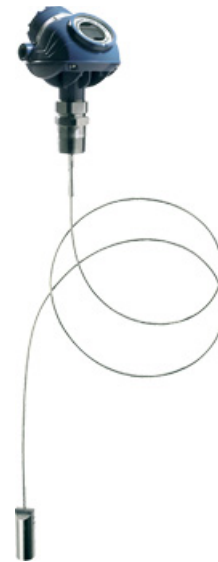
Figure 3. Rosemount 5300

The Emerson logo is a trade mark and service mark of Emerson Electric Co. Rosemount and the Rosemount logotype are registered trademarks of Rosemount Inc. All other marks are the property of their respective owners.