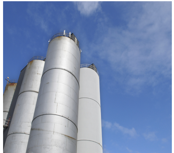
Figure 1. Rosemount 5303 in 80-ft (24.4 m) tall silo successfully monitors level of shelled corn.

Without a usable level measurement, the plant incurred additional labor expenses. Several times a week, maintenance personnel needed to put on safety harnesses and climb to the top of the silos to manually measure the corn level. If the silo went empty between measurements, production would be stopped. Conversely, if the silo overfilled, corn would be wasted and the area would need to be cleaned. Lastly, the lack of level information prevented this customer from optimizing the schedule for unloading corn railcars.