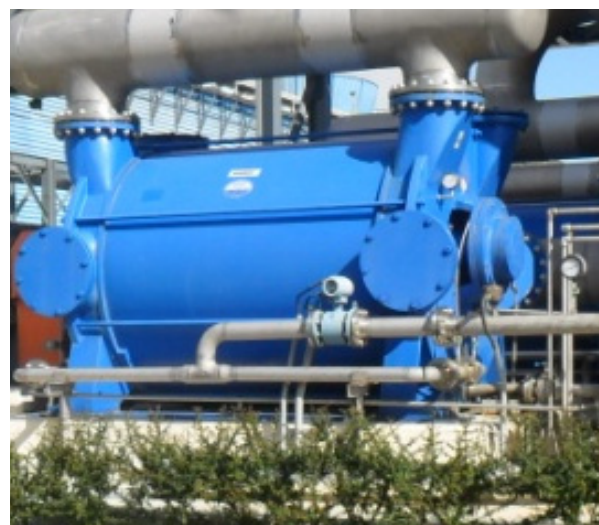
Installed Magnetic Flowmeter in a cooling water application.