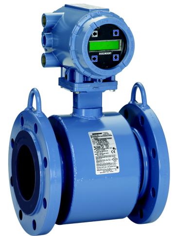
Rosemount 8705 with integral 8732.