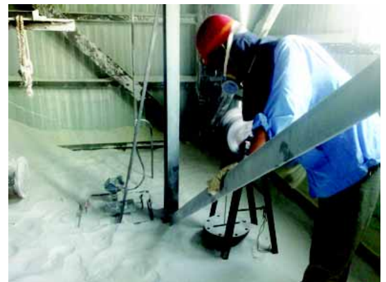
This newly installed Rosemount 5300 eliminated future overflow

The high performance Rosemount 5303 decreased the number of process interruptions, and ultimately increased the availability of the facility.