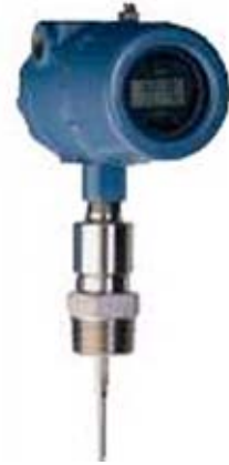
Rosemount 3300 Guided Wave Radar Transmitter with rigid single lead probe.

The Emerson logo is a trade mark and service mark of Emerson Electric Co. Rosemount and the Rosemount logotype are registered trademarks of Rosemount Inc. All other marks are the property of their respective owners.