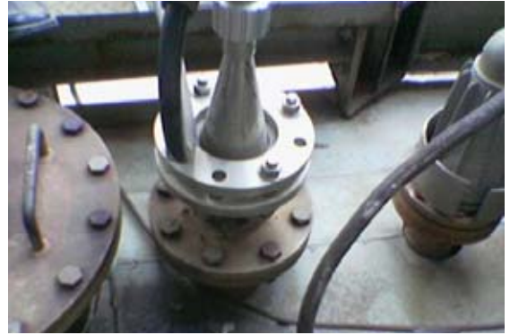
The 12 in (300 mm) nozzle on which the Process Seal antenna is mounted.

http://www.emersonprocess.com/solutions/chemical