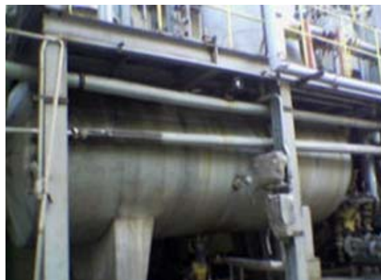
The horizontal vessel is heated to 212-250° F (100-120° C)

The Process Seal antenna is mounted on a 12 in (300 mm) tall nozzle, which is the maximum allowed nozzle length. Care was taken to ensure that there was no tilting or inclination and that the inside surface of the