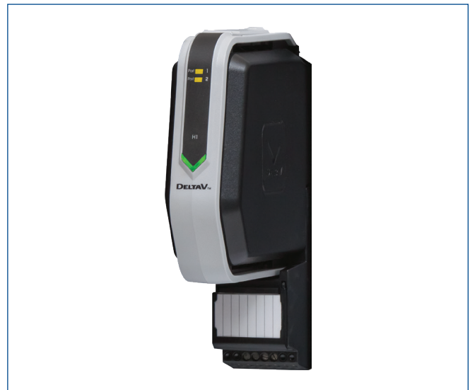
S-series H1 Fieldbus I/O Interface Card.

The Fieldbus I/O Card meets ISA G3 corrosion specifications by using superior electronic components and conformal coating.