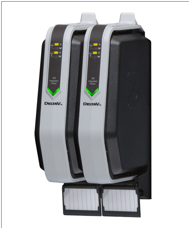
Redundant S-series H1 interface with integrated power.

Segment power supplies are integrated into this H1 card, greatly simplifying installation design, reducing footprint and improving segment diagnostics. The terminal block includes a fixed segment terminator, eliminating external wiring to fieldbus power supplies and their terminators. Redundant H1 cards provide redundant power to the segments for increased availability.