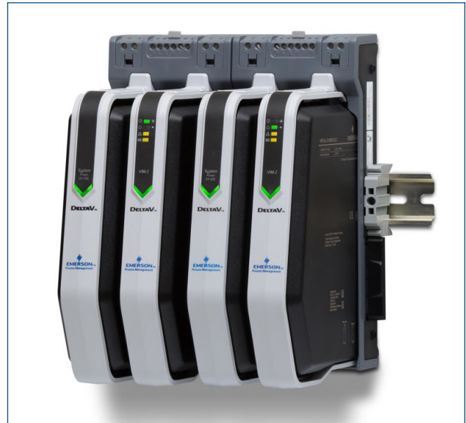
The S-series Virtual I/O Module 2 provides DeltaV I/O simulation and a high speed Ethernet I/O device integration platform.