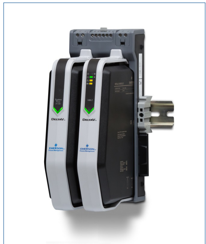
S-series System Power supply and VIM2.

Modular, flexible packaging. The VIM2 mounts in the same manner as the DeltaV controller. It mounts in the controller slot of a DeltaV 2-wide horizontal carrier and uses a standard DeltaV System Power Supply. The advanced design of the VIM2 will provide years of uninterrupted use.