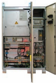
Chloride Industrial Power Uninterruptible Power Supplies

AMS Device Manager provides configuration features and the interface for the advanced diagnostics used with HART, FOUNDATION fieldbus, and PROFIBUS instrumentation. It also stores all remote asset data including tag numbers, names, locations, calibration status, configurations, diagnostics, and documentation. Connect your UPS via DeltaV™, Ovation™, or for third party systems via the PROFIBUS interface to AMS Device Manager, enabling all the benefits of asset management in a single system for all of your critical assets.