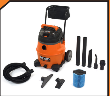
Vac with Accessories & Filter