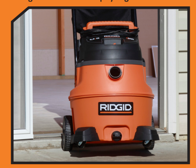
Rear Wheels-Rough Terrain Mobility