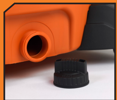
Large Drain for Emptying Water