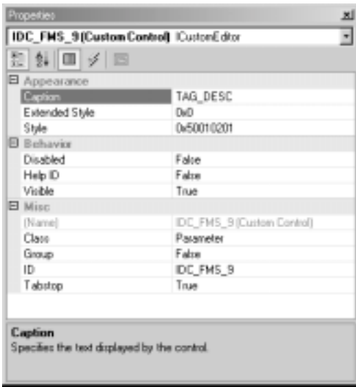
Figure 4-1. Parameter Control Properties Dialog Box in Microsoft Visual Studio .NET 2002