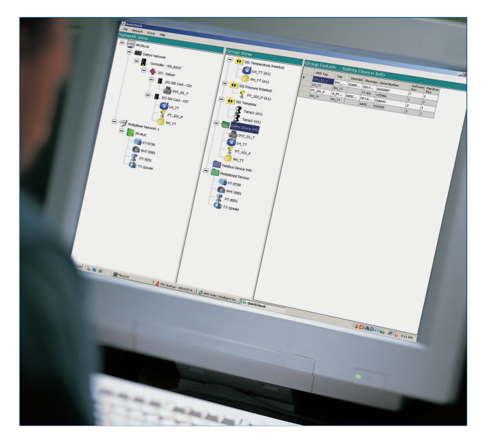
Streamline interlock checkout by grouping, monitoring and fixing the output of HART<sup>®</sup> transmitters from the convenience of your AMS Device Manager workstation.