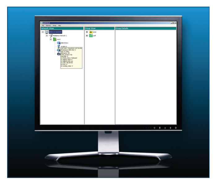
Access basic diagnostic information by simply hovering over a device.