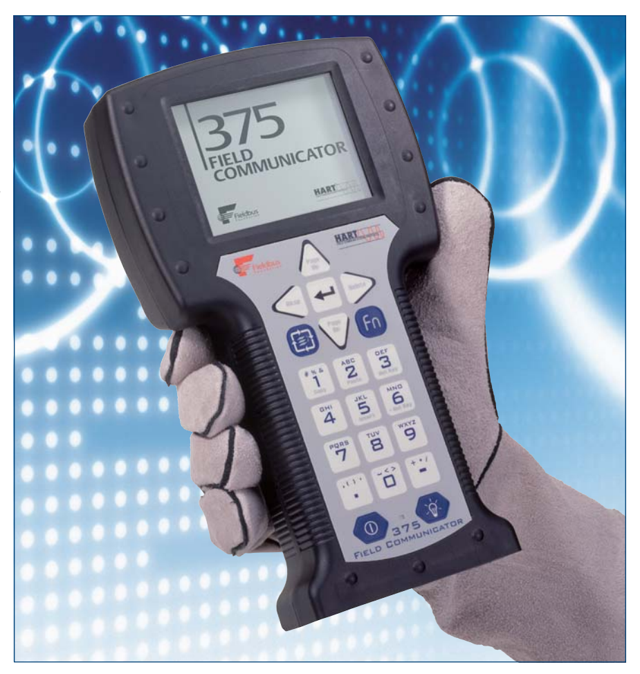
The 375 Field Communicator is designed to support all HART and all FOUNDATION fieldbus devices from all vendors.