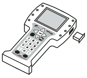
The Configuration Expansion Module safely stores hundreds of device configurations.

of device configurations safely in your 375 Field Communicator.