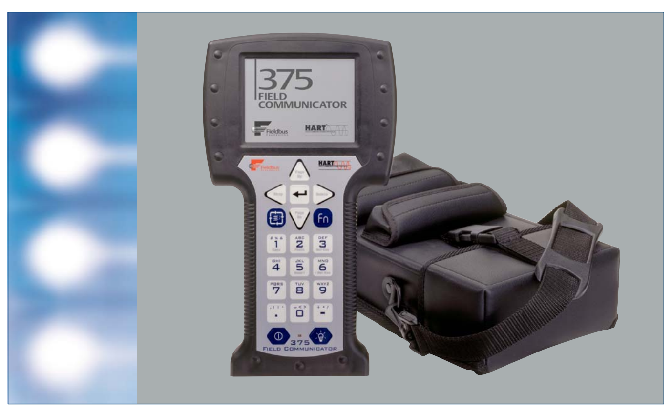
Designed not only for use on the bench, the 375 Field Communicator enables you to do those tasks that just have to be done in the field.

■ Universal – HART® and FOUNDATION™ fieldbus