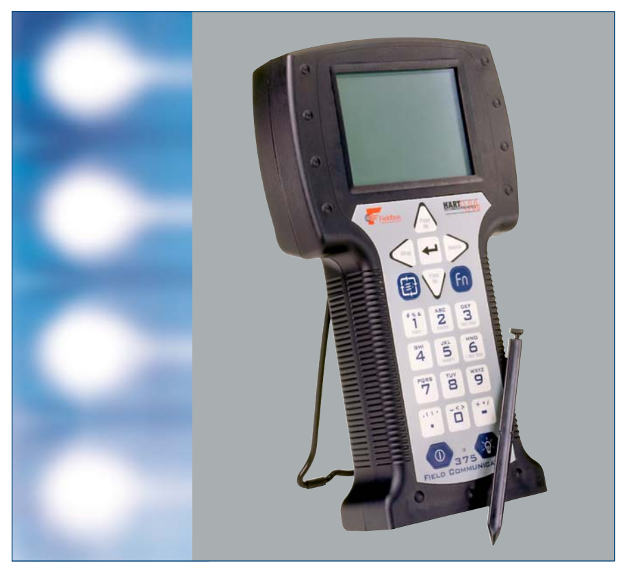
A fold-away stand provides the correct viewing angle on the bench, and flips up to a locked position for secure hanging in the plant.