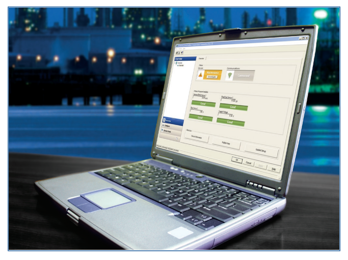
AMS Device Manager gives you easy access to HART, FOUNDATION<sup>™</sup> Fieldbus, and WirelessHART devices, all in a single application.