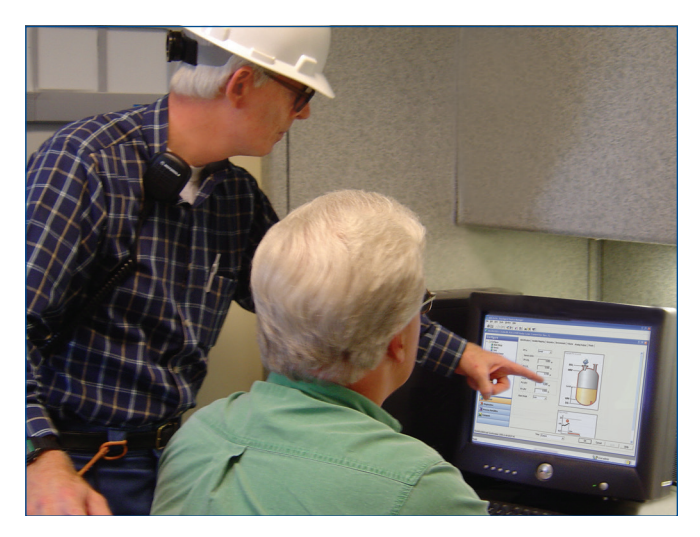
The HART Over PROFIBUS Interface is easy to implement and cost effective because it works with your existing devices and remote I/O.