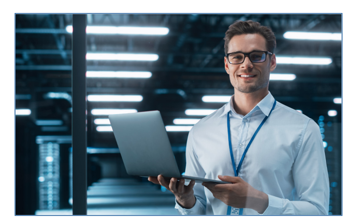
All device information is stored in a single database, so you can quickly evaluate calibration trends for each device and ensure calibrations are completed on time.