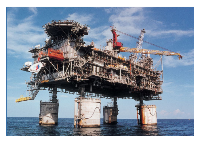
Gain online connectivity to HART devices in offshore oil and gas applications with AMS Device Manager and the Kongsberg Maritime system.