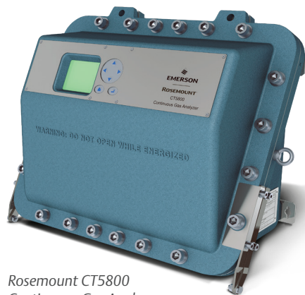
Rosemount CT5800 Continuous Gas Analyzer

*Repeatability is ±1 % of reading or the Limit of Detection (LOD), whichever is greater. Other ranges are available. Please consult an Emerson application specialist.