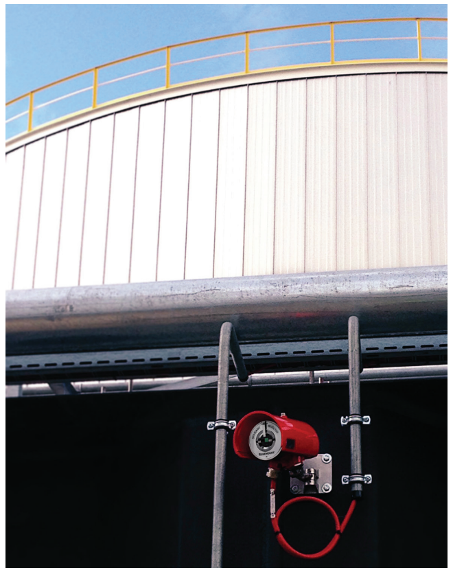
Figure 4. Flame detectors look for radiation in specific wavelengths emitted by hydrogen- and carbon-based combustion.