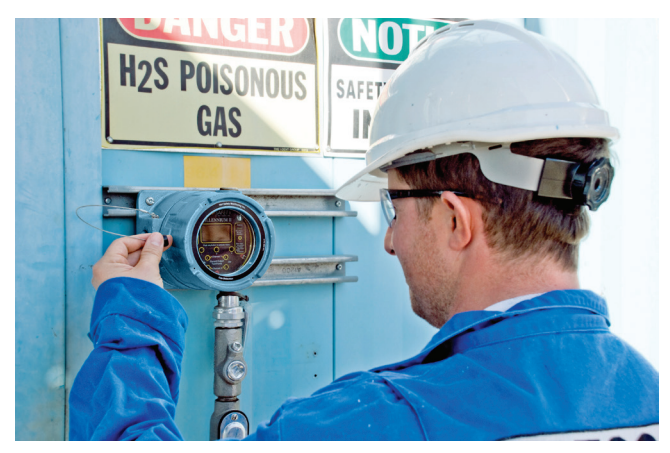
Figure 2. This type of fixed-point combustible gas detector can detect a wide variety of flammable gas types with percentage of lowest explosive level measurement.

Fixed point combustible gas detectors use one of two sensor technologies. Catalyst bead sensors facilitate an internal chemical reaction in the presence of a variety of gases, both hydrocarbon- and nonhydrocarbon-based (Figure 2). Infrared sensors respond to the specific light wavelengths absorbed by the flammable gas. Both technologies depend on a cloud of gas drifting to the individual sensor with sufficient concentration to be detected. Fixed point detectors are usually deployed where there