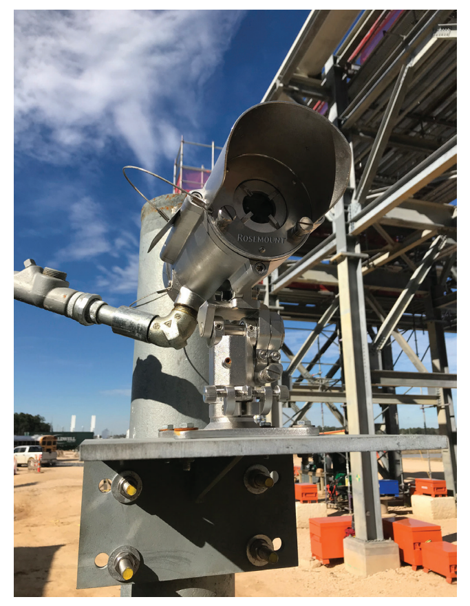
Figure 3. An open path combustible gas detector can detect a cloud of gas moving through its beam, even if it has diffused to a relatively low concentration.

Open path combustible gas detectors send a light beam from a transmitter to a receiver (Figure 3) to detect combustible gases moving through the beam. These cover a wider area, at least in one direction, than a fixedpoint detector and are therefore deployed like a fence around the perimeter of equipment and tank clusters. They also are subject to ambient air movement issues, so most facilities deploy multiple units.