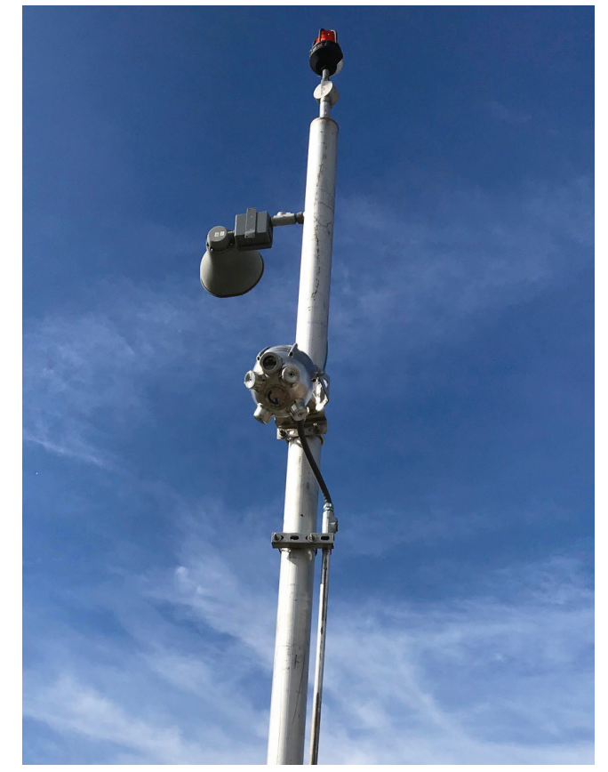
Figure 1. An ultrasonic gas leak detector, such as this one, can capture the sound of a compressed gas leak, and using its directional sensors, help pinpoint the source.

If the situation is beyond what the SIS can deal with, a release of flammable liquid or gas might occur. Gas