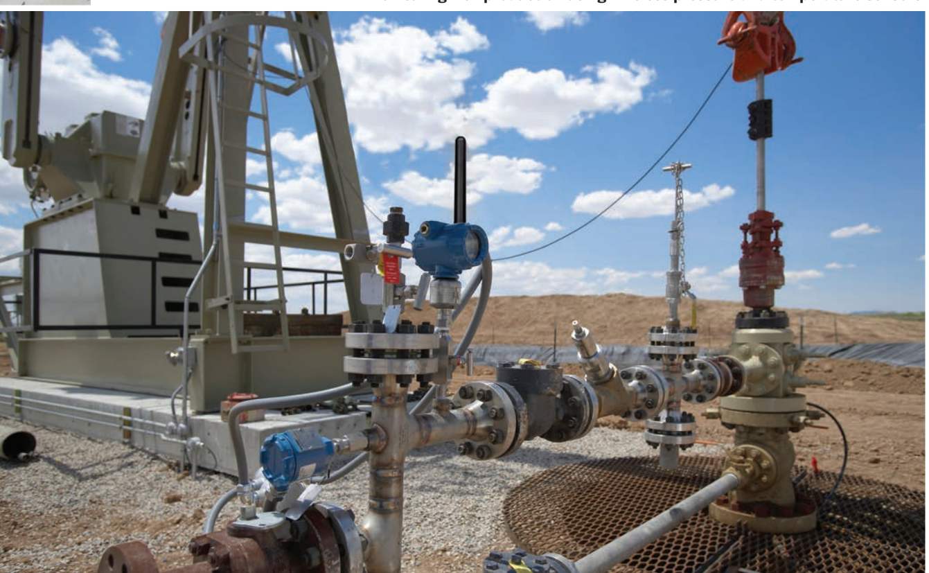
Content is copyright protected and provided for personal use only - not for reproduction or retransmission.

Monitoring well production using wireless pressure and temperature sensors.