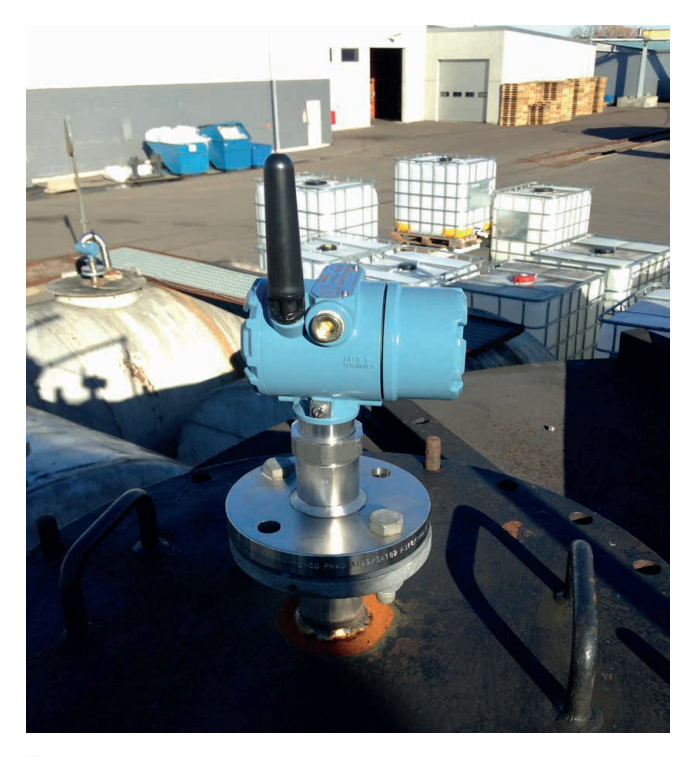
Figure 4. The geographically spread-out arrangement of most tank farms can make adding traditional wired instrumentation prohibitively expensive. Wireless sensors, such as this guided wave radar level device, can use WirelessHART to send information to the automation system.