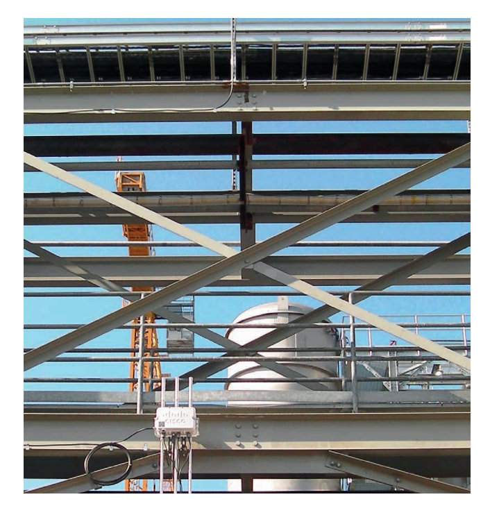
Figure 2. A wireless gateway can serve as backhaul or bridge to other gateways and collect data from many nearby wireless sensors, sending the data to a central computer.

For example, Pump Station 2 on the Alaska pipeline is designed to pump 60 000 gal./min. (227 m<sup>3</sup>/min.) of oil. A measurement error as small as 0.1% can result in an inaccurate calculation of around 86 400 gal. in 24 hrs (330 m<sup>3</sup>/d). This equates to approximately 2070 bpd of oil. At a spot price of US$44/bbl, that 0.1% error would equate to US$91 000/d. Over a year, the 0.1% error would amount to a difference of US$33 million. Note that the error could either be on the high side, benefiting the seller; or on the low side, to the buyer's benefit.