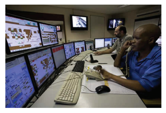
Figure 1. A centralised pipeline monitoring system relies on data that sometimes is sent from thousands of miles away.