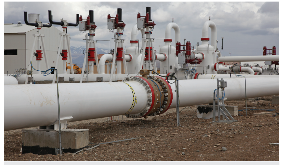
Figure 2. BOTAS natural gas compressor station at Çayirli, a town in the Erzincan Province of Eastern Turkey.

BOTAS operators with an intuitive view of meter functionality and status, and allows them access to real-time process