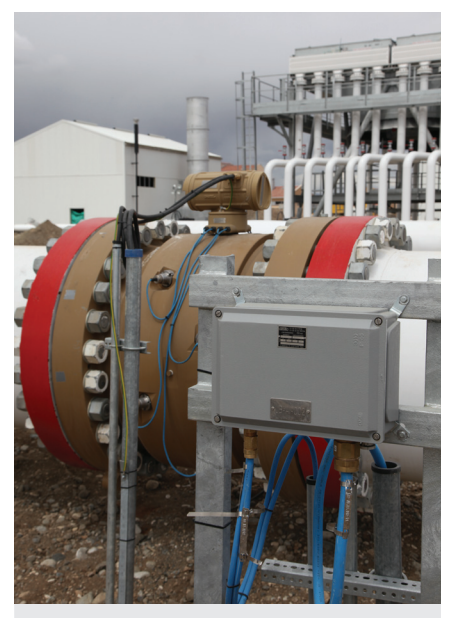
Figure 5. The availability of an accurate allocation metering system was a key requirement in the development of the new gas compression station that will serve the natural gas pipeline running across northern Turkey.

flow measurement information, to the flow computers via an RS-485 link using the Modbus protocol.