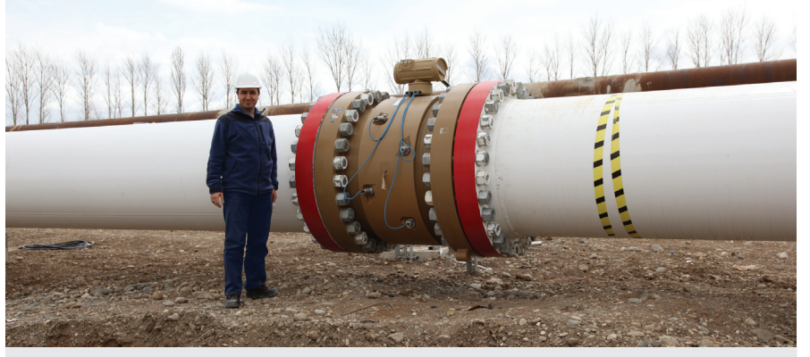
Figure 1. Daniel Measurement and Control's 42-inch SeniorSonic ultrasonic flowmeter installed in the BOTAS pipeline.