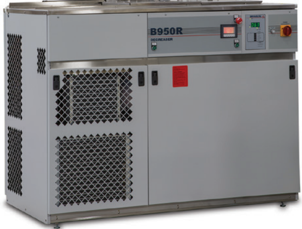
Model B950R shown with optional dual-axis lift

Branson's worldwide reputation for excellence in ultrasonics includes the precision performance of the B-Series Ultrasonic Solvent Vapor Degreasers. For more than 60 years Branson has been setting the standard for advanced ultrasonic cleaning equipment, part of a long line of