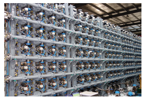
A 3 inch manifold with 36 inlets and 12 outlets undergoing Factory Acceptance Testing.

www.emerson.com/integratedblendingsolutions