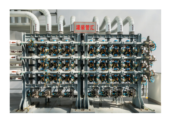
A finished product manifold equipped with 8 inlets and 6 outlets.