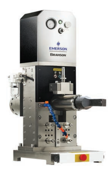
GMX-20MA Metal Welder

The move to electric and autonomous vehicles presents a new set of complex challenges for your assembly of metals and plastics. You need to join complex assemblies with low-resistance connections of sensors, cameras and hi-tech lighting inside and out. You need an assembly solution for metals that can accommodate 100+ layers of copper foils, and large diameter cables that will enable faster battery charging. Plastics joining challenges continue to evolve as well. You need an efficient solution for large parts with complex geometries and advanced technologies that can perform perfect welds atop delicate electronics and with disparate plastic materials. It's a daunting challenge, especially when you consider that weld quality remains paramount and requires confirmation through digitally traceable process data.