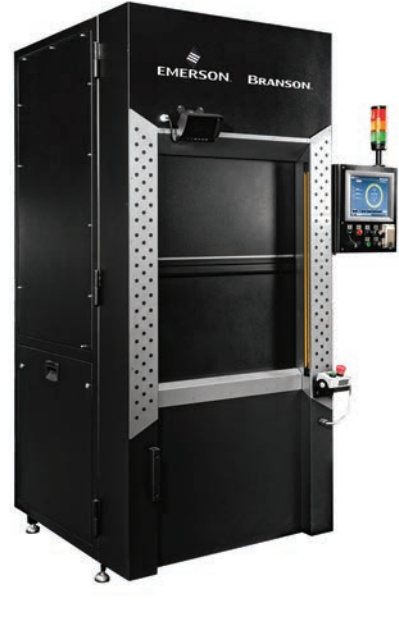
GL-300 Laser Welder