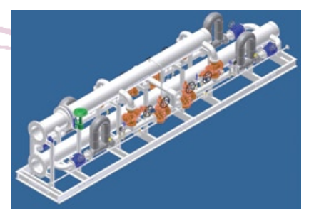
Total system size (m): 11.9L x 2.2W x 2.8H Nominal flow capacity: 4000 m<sup>3</sup>/h

Maximum flow capacity of measurement system within required pressure drop.