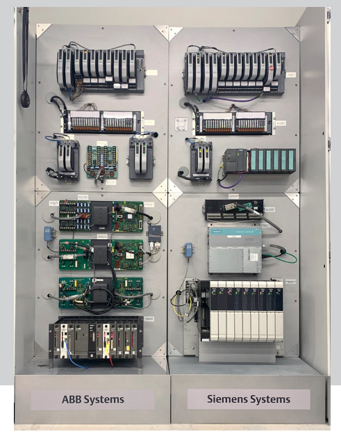
DeltaV Electronic Marshalling.