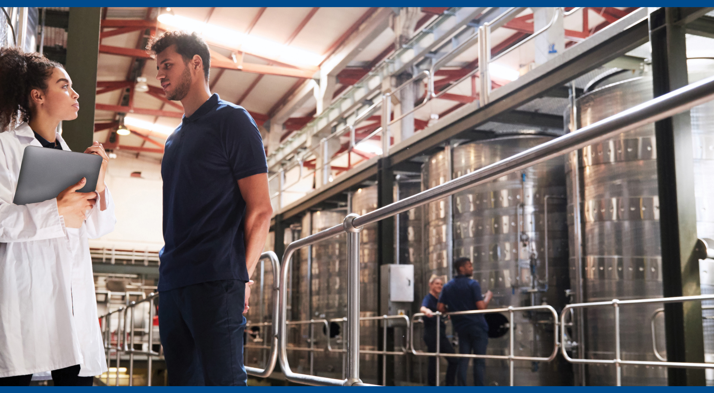
Emerson can provide innovation solutions across your plant from project kickoff through operations to maximize performance.