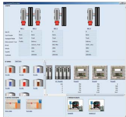
Overview—Entry, Exit, Scale, Tank, Gantry