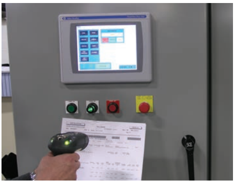
Product and Process Verification

Designed to isolate the cleaning area from the outside environment, this feature helps maintain part cleanliness and provides increased operator safety.