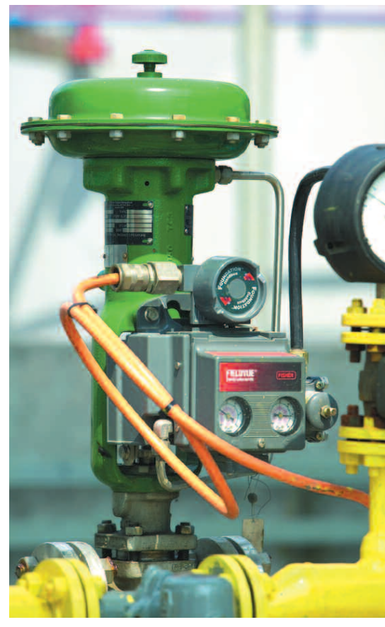
Robust Foundation Fieldbus cabling networks the digital Fisher control valves that feature 'Control in the Field' capabilities with integral PID control

With the first shutdown of the cracker not scheduled until 2009, and the other plants on a two-year schedule, asset management will play a vital role in keeping the complex at peak performance. 'The predictive diagnostics of PlantWeb and AMS Suite will help optimise our maintenance plan,' adds Howell, 'enabling personnel to focus directly on the problems, which will greatly improve efficiency and minimize downtime. Knowing what the problems are beforehand, the staff can schedule maintenance and obtain the needed parts. Where there are no problems,