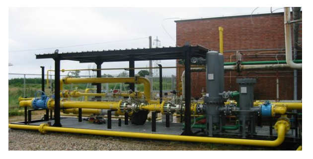
Pressure reducing station

devices to use to protect equipment and pipeline from overpressure problems can be regulated by national standards, or by customer internal procedures.