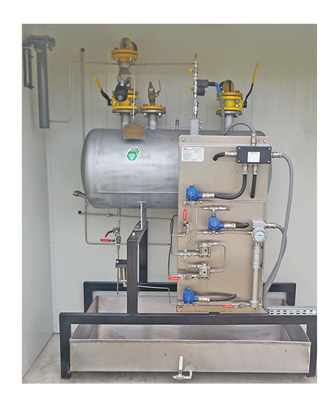
Type Dosaodor-D Pneumatic Panel

Emerson odorizing solution lowered annual operational costs by 3620€ per installation by reducing the number and duration of periodical checks and maintenance operations, while assuring a safe and accurate natural gas grid odorization.