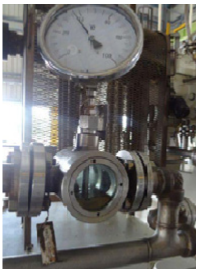
This sight glass and gauge needed to be read and manually recorded at the correct times.

http://www2.emersonprocess.com/en-US/brands/rosemount/Level/2100-Series-Level-Switches/2160-Level-Switches/Pages/index.aspx