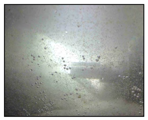
Sand touches the FDM tines, while the fork continues to operate as normal

Using this approach, the Micro Motion Fork Density Meter can confidently be used in place of a nucleonic device as a lower-cost, maintenance-free way to automate identifying the need for sand removal in separators.