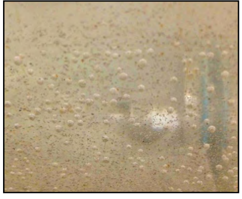
Sand covers the FDM tines, alarming the customer by generating an 'enhanced event' on a digital output