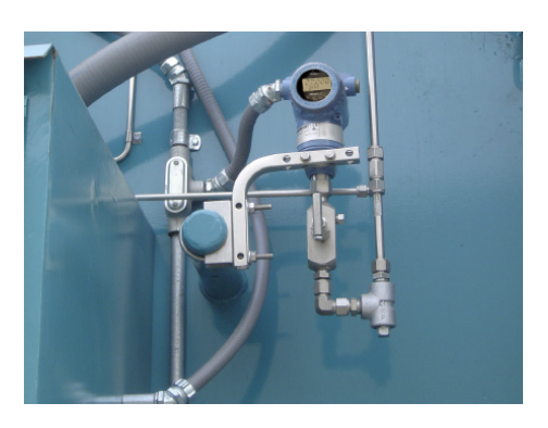
Rosemount™ 3051T Pressure Transmitter with Inline Manifold measuring absolute pressure.

The Emerson logo is a trademark and service mark of Emerson Electric Co. Brand logotype are registered trademarks of one of the Emerson family of companies. All other marks are the property of their respective owners. © 2023 Emerson Electric Co. All rights reserved.