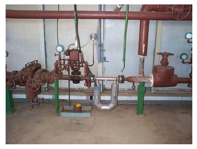
Micro Motion metering solution

For more information: www.MicroMotion.com/power www.MicroMotion.com