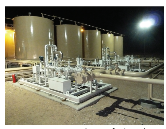
Lease Automatic Custody Transfer (LACT) unit