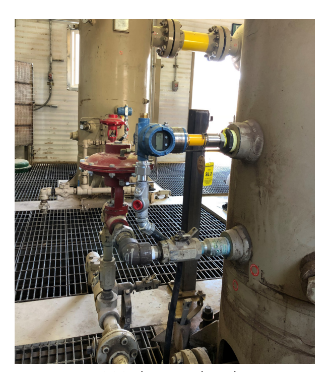
Rosemount 2140:SIS Vibrating Fork Level Detector installed on a scrubber bottle

"We have significantly increased our profits by being able to prooftest level alarms with virtually no process interruption."