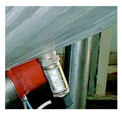
Figure 2. Signal is fed directly to the PLC via its PNP output.

For more information,visit Emerson.com/Food-Beverage