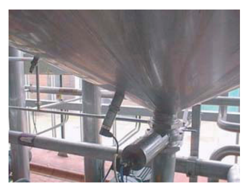
Figure 1. The compact vibrating fork level switch is easily mounted in the bottom of the tank.