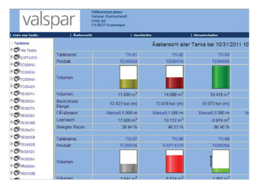
After the installation: inventory is automatically monitored. Precise measurement data is published in both German and English on the local intranet.