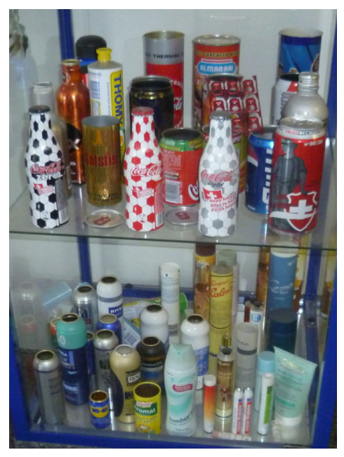
This particular site in Grüningen Switzerland, is an entity that mainly produces coatings for rigid packaging, particularly for tubes, monoblocs, food and beverage cans.

The level measurement needs to be completely automatic, with the resulting inventory data made available on the web for everyone connected to Valspar's intranet – also for the local branch office in the UK. The steel tanks were located underground, with limited head-space and connection possibilities.